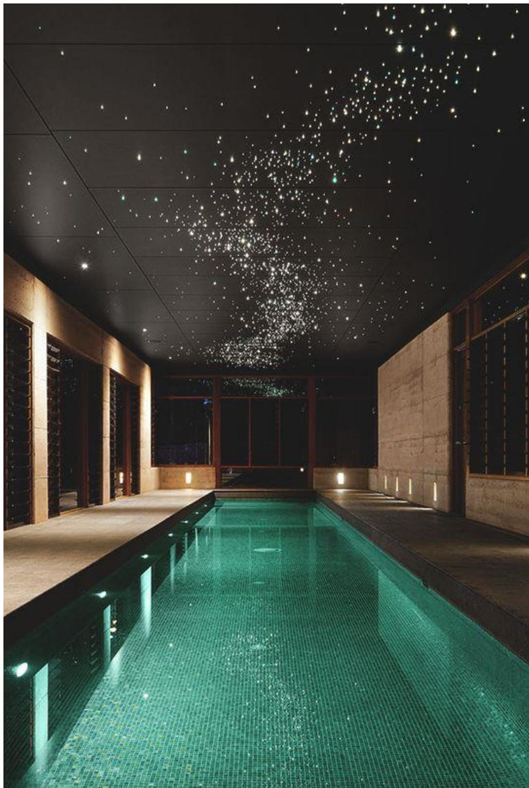
SPA. INDOOR SWIMMING POOL