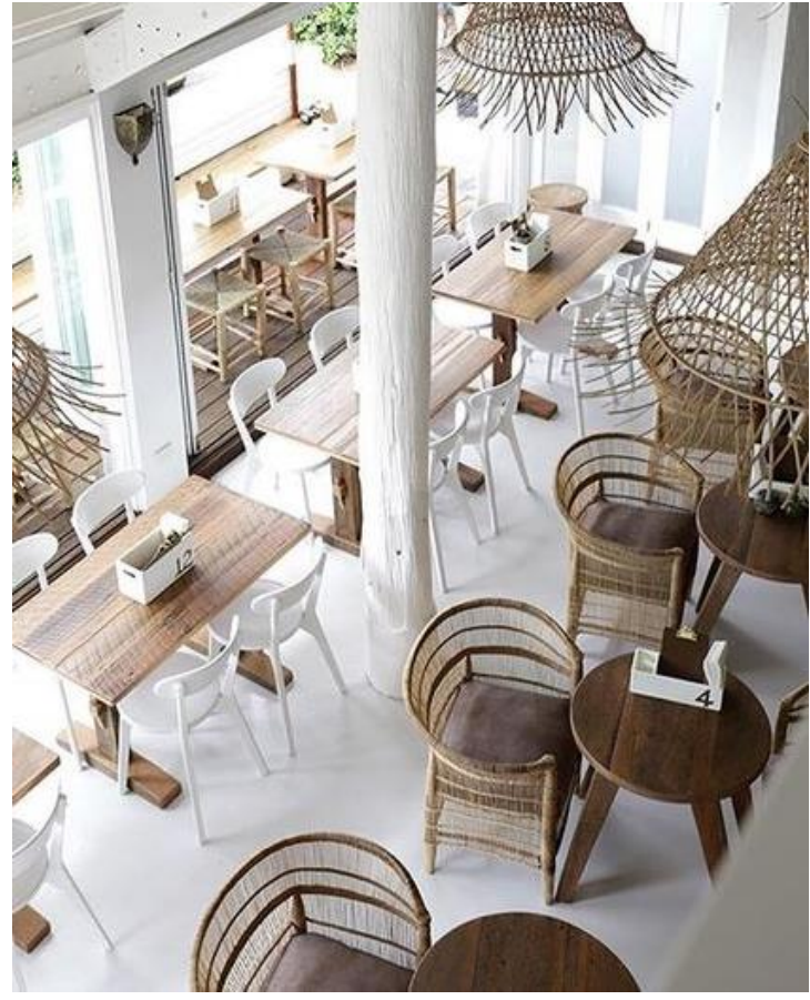
BEACH BAR / RESTAURANG