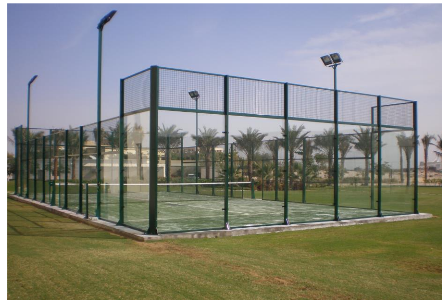
MAINTENANCE OFFICE. PADEL TENNIS. RESTAURANT. BAR BY THE POOL AND HIKING ROADS